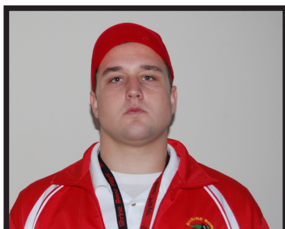
South Carolina (Wren High School) Left Guard

“When I visited, I liked the staff. They all reminded me of my high school coaches.”