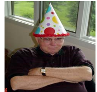
Guess who else said the wrong thing?

review the suggested new activities and place them in a time frame that they should be considered; i.e. three, five, or seven years. A one day follow-up meeting will be scheduled for later this year at the Shrine Bowl office in Ft. Mill to continue the discussion..